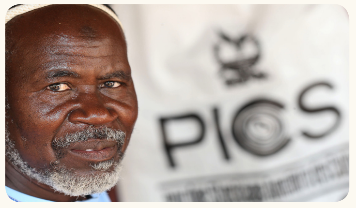
A PICS bags vendor in Po, Burkina Faso.

A special PICS effort was launched in Sierra Leone to help farmers store their seeds and grain after markets had been disrupted due to the Ebola crisis This effort was funded by CRS Sierra Leone. Purdue partnered with Catholic Relief Services, Cordaid, and local NGOs to promote PICS bags. Community awareness was created through short message services (sms) and, radio programs and advertisements. Given the quarantine, PICS trainings were conducted in small groups and also using mobile phone videos and posters. Ten thousand (10,000) PICS bags were imported from Mali into Sierra Leone. Twenty technical trainers received training that they relayed to 128 field agents. About 3,728 farmers received 2 PICS bags each. Among these farmers, 56% stored rice grain, 36% stored rice seed, and the remaining stored cowpea, maize, gari and dried cassava. The PICS bags put farmers in charge in responding to disaster, making them more resilient to the Ebola crisis. For more information Read More