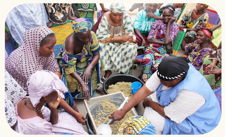
Women producers being taught how to process millet into degué and cowpeas into beroua . (Chaibou Naroua)

In 2015, MISOCO field agents conducted training activities on post-harvest storage technology (including PICS bags) for 194 POs and SILC groups. Out of the 6,365 participants 53% were women. Out of the 150 producers' organizations that developed business plans, 8 received US $30,000 in loans from microfinance institutions allowing them to invest in seeds, fertilizer, and pesticides to increase their production. The project successfully facilitated the sale of agricultural produce to the World Food Program and grain traders in 2013 and 2014 harvest seasons. The WFP purchased a total of 729.8 tons of millet and cowpea for US $434,212. Wholesalers, mostly from Nigeria, also bought 583.91 tons for $235,818. In total, the producer organizations sold grain valued at US $670,030 in both years. POs are preparing for even larger group sales following the 2015 harvest.